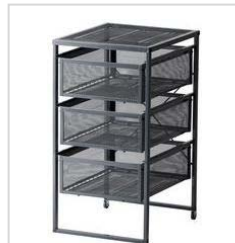
LENNART – option 1 grey drawer unit