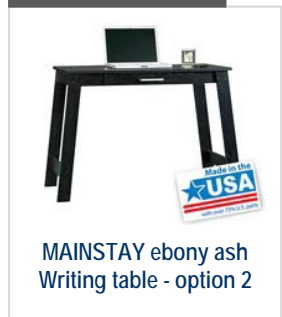
MAINSTAY ebony ash Writing table - option 2