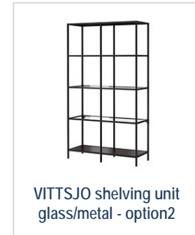
VITTSJO shelving unit glass/metal - option2