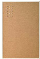
VAGGIS notice board