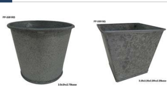
CHEUNGS round or square galvanised pot