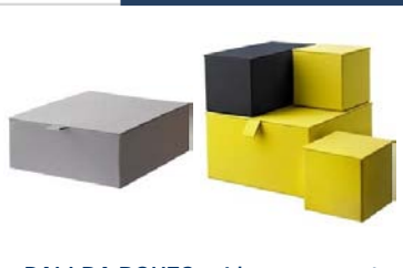
PALLRA BOXES – 4 boxes per set GREY PALLRA RECTANGLE BOX