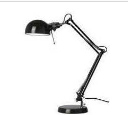
FORSA black work lamp – lighting source in an open plan living