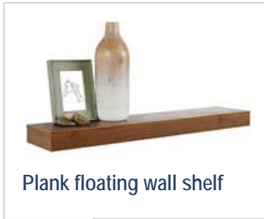
Plank floating wall shelf