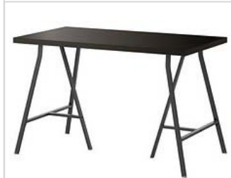
LINNMON LERBERG black desk table 120cmL