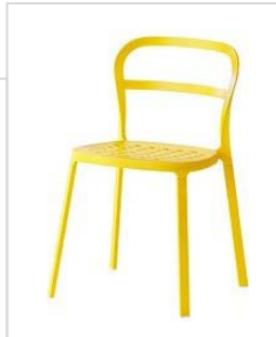
REIDAR yellow chair for sitting at desk table